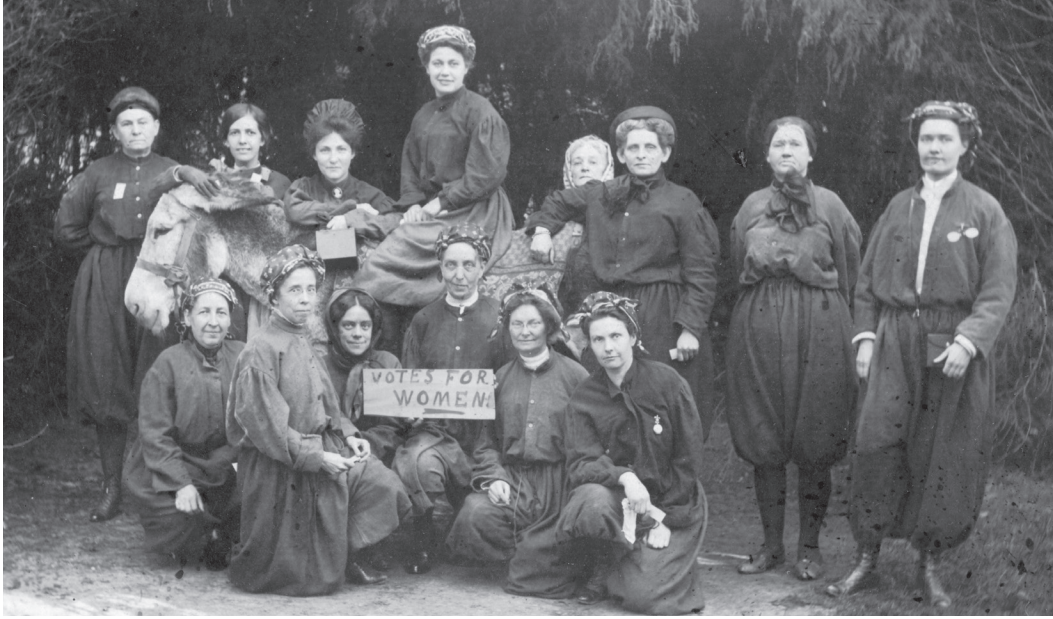
Wisconsin suffragists holding “Votes for Women” sign, c. 1903. WHS IMAGE ID 9381

as a subject of amusement. Consider, for example, newspaper coverage of 1905 Senate Bill 397, which proposed to “[extend] the right of suffrage to women in city, village and town matters.” (This was a proposal for partial suffrage rather than full suffrage, i.e., voting rights specific to certain elections rather than all elections. 6 ) The Evening Wisconsin focused on suffragists’ appearance in recounting their testimony at a hearing on the bill: Dr. Maud Saunders “wore an exquisite tan dress trimmed with buff stripes down the front, and with inserted pleats and real Irish lace trimmings,” and the Reverend Olympia Brown sported “a red silk creation with pink epaulets.” The article’s subtitle reinforced the idea that women’s fashions warranted more attention than their words: “Exquisite Dresses and Gentle Words Stir Senate Committee to at Least Make Promises.” 7 Ultimately, 1905 Senate Bill 397 was “indefinitely postponed” in committee. 8